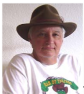
The Fiscal Conservative Creeker